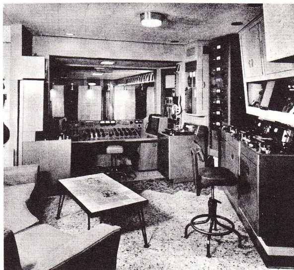
Master control room with professional equipment